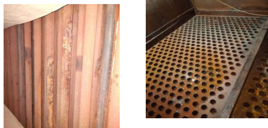
Fig :- Recuperative air pre heater ( shell and tube)

Recuperative air Pre- heaters are also known as tube and shell air Pre-heater. In tubular type air Pre-Heater, the ambient air enters in side of tubes and the hot flue gas passes out side of the tubular section and the shell. In this the heat transfer will be from the exhaust gas to the air inside the preheater. Ambient air is circulated by a forced draught fan through ducting at one end of the preheater tubes and at other end the heated air set of ducting, which carries it to the boiler furnace for combustion.