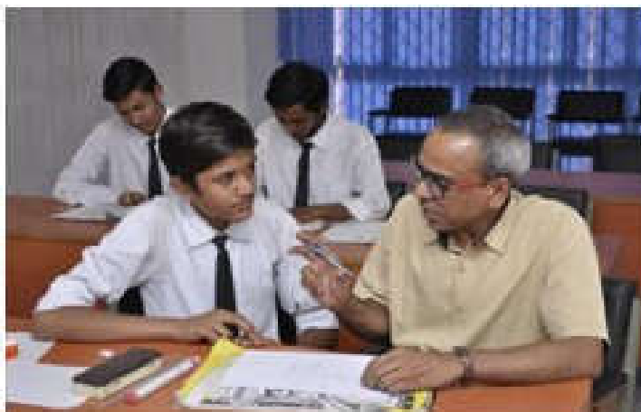
Figure 2. Student Centred Strategy