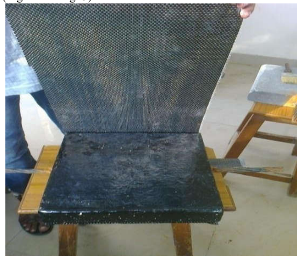
Fig. 2 Wrapping of FRP sheet after coating Epoxy paint [10].

Firstly, the samples are air dried prior to the application of FRP wraps and grinder is used for rounding off the sharp corners. Manufacturer specifications are followed in the application of the wraps. A Wire Brush is used for roughing of slab surface so as to have proper bond between slab surface and epoxy. Conductive Epoxy in the ratio of 100:40 is used for wrapping the carbon fibre sheets onto concrete (Fig. 2 and Fig. 3).