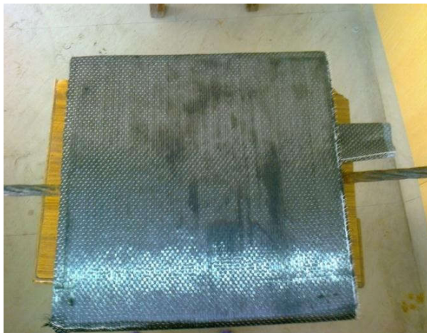
Fig. 3 FRP wrapped on concrete surface [10]