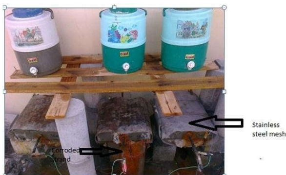
Fig. 1 Block Specimen subjected to 5% NaCl Solution [10]

By continuously dripping with 5% NaCl solution specimens are kept fully saturated (Fig. 1). The strand is used as anode. A stainless steel (SS) mesh is rolled around 300 mm length of specimen and tied together with metal ties in order to assure electrical continuity is used as cathode. The constant voltage of 5 mV is impressed in order to accelerate corrosion