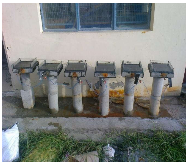
Fig. 4 Set up of slab specimens for Active Protection [10]

To simulate corrosion damaged structures, prior to the application of wrap, an initial exposure is applied whose time of exposure was so adjusted so as to have three levels of damage namely (i) onset of corrosion, (ii) onset of visible crack, and (iii) 2 days after onset of visible crack are applied. After initiation of corrosion the specimens are allowed to be wrapped with FRP sheets and also a constant anodic current of 10 mA is supplied with CFRP sheet as anode and tendon as cathode. Specimens for Active Protection in which positive terminal are connected to the carbon fiber ribbon and the negative terminal is connected to the pre-stressing strand (Fig. 4). Corrosion monitoring is done as explained earlier using half-cell potential and LPR measurements for a period of 30 days [10].