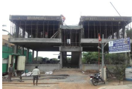
5.1 ON SITE