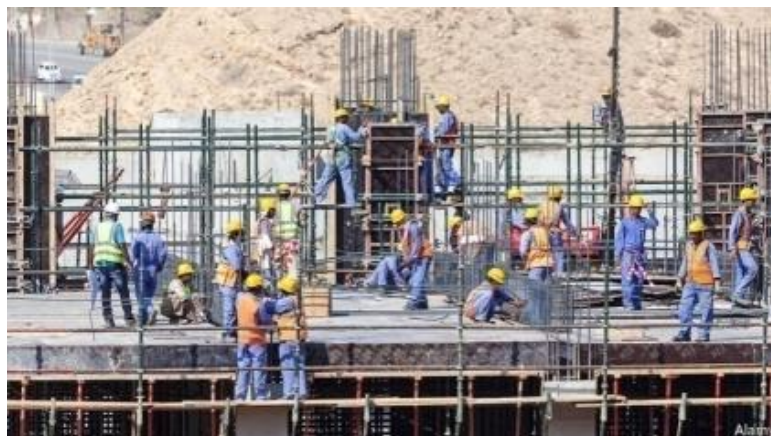
FIG 1.1 CONSTRUCTION SITE.

General: Construction industry is world's most largest and challenging industry. Human resource has a strategic role in increasing productivity in construction industry. With the effective and optimum use of human resources can help in productivity growth. The construction projects are mostly labour based with basic use of hand tools and equipment's in which labour cost consists of about 30% to 50% of total project cost. Indian construction industry is one of fastest growing sector globally. The construction sector gives second largest employment after agriculture. India shares about 8% of total GDP and also provides employment to around 35 million peoples directly or indirectly. In construction industry one of the biggest problems faced is of unskilled labour which implies in productivity loss and impacts on cost overrun and schedule daily.