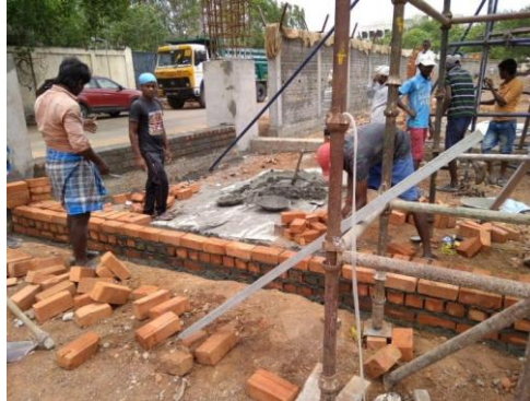
FIG 4.1: LABOUR PRODUCTIVITY

Productivity in construction is often broadly defined as output per labor hour. Since labor constitutes a large part of the construction cost and the quantity of labor hours in performing a task in construction is more susceptible to the influence of management than are materials or capital, this productivity measure is often referred to as labor productivity