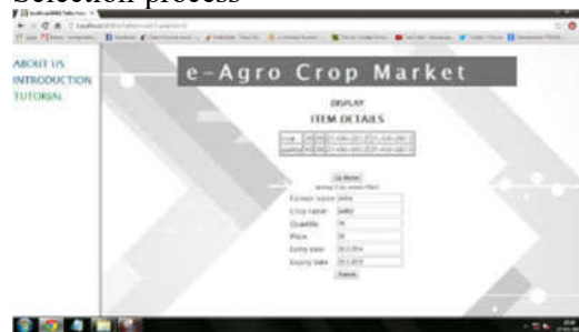
Fig.4 selection process