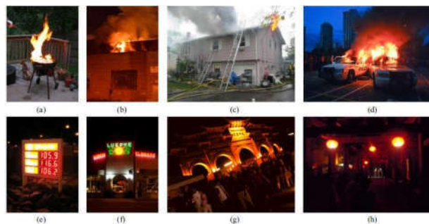
Figure 2: Sample of fire image

G. Laneve et al.,[10] The limits identified with the affectability of the geostationary sensor to fire sizes have been, essentially partially, defeat by presenting explicit calculations. Notwithstanding, the diminished exactness in the geographic localization of the fire, which can, on a basic level, possess any situation in a space of around 16 km 2 (at Mediterranean scopes), makes this data not extremely fascinating for the organizations associated with firefighting. This work investigates the attainability of working on the localization of the warm peculiarities (areas of interest) by consolidating images obtained simultaneously from various MSG satellites situated at various longitudes. Specifically, we consolidate the images obtained by MSG-9 situated at long. 9.0°, MSG-10 situated at 0.0° and MSG-8 situated at long. 41.5°.v.